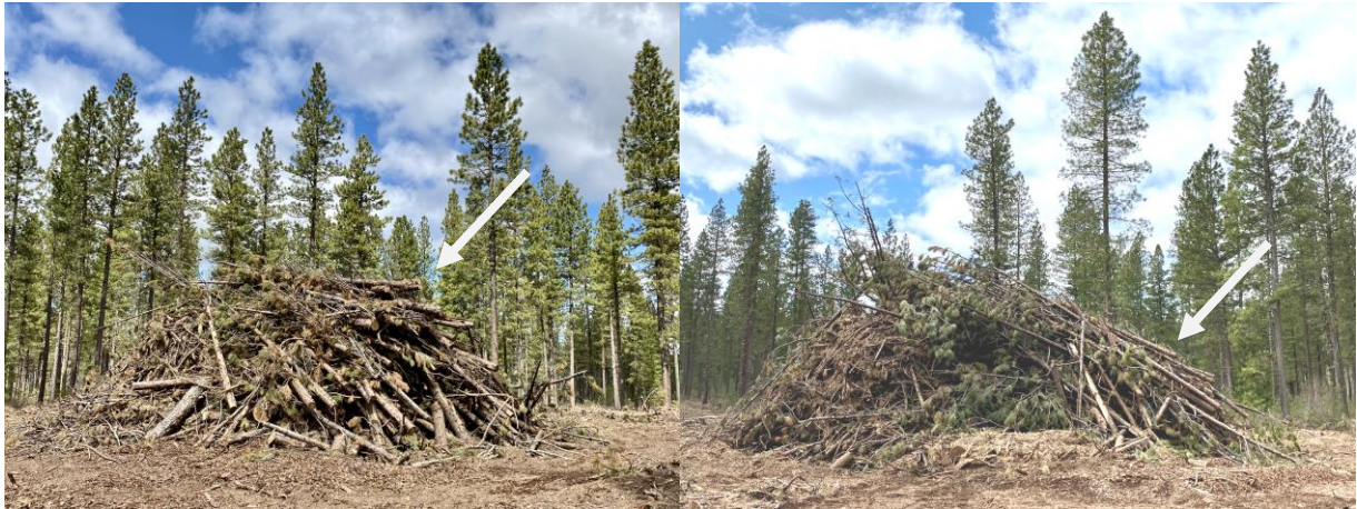
Figure 6. Specified “green” slash and desired piece size (arrows).