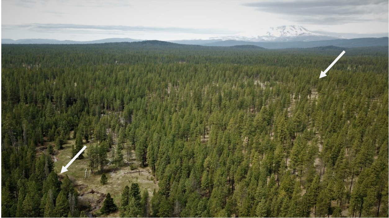
Figure 5. Aerial view of project site (bottom left corner) and landing where wood will be staged (upper right corner).