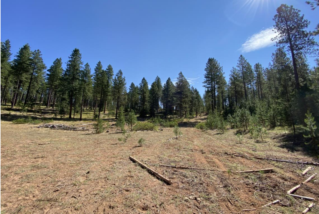
Figure 3. View looking uphill of portion of unnamed spur that needs to be improved to allow truck access. Road runs straight down fall line of hill and erosion has caused large boulders to be exposed in the road bed