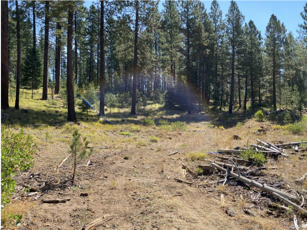
Figure 4. Possible alternative hill climb route that contours side hill.