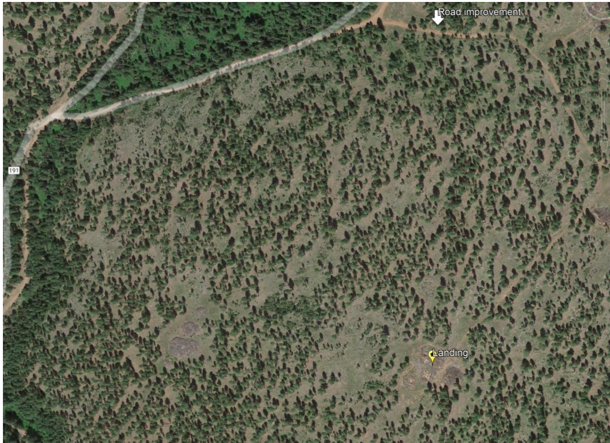
Figure 2. Zoomed in view of unnamed spur, in need of improvement along approx. 500 linear feet and distance from 191 road to landing, approx. 0.5 miles.