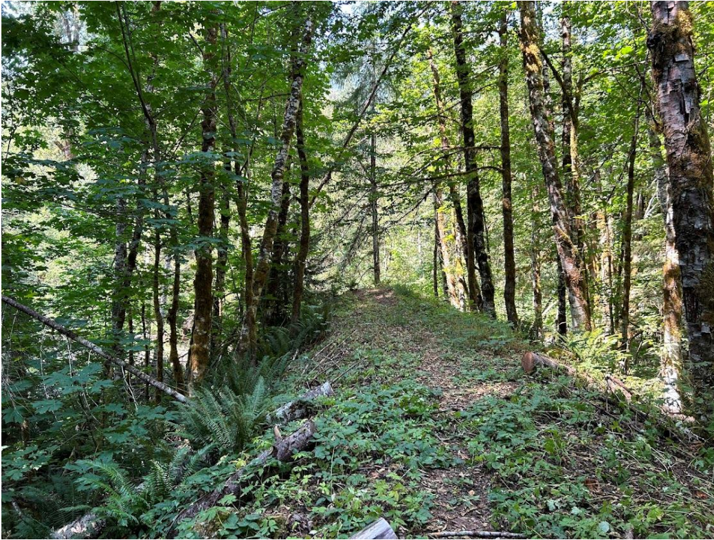
Site Photo 1: On top of spoil pile, halfway down looking toward Dry Creek