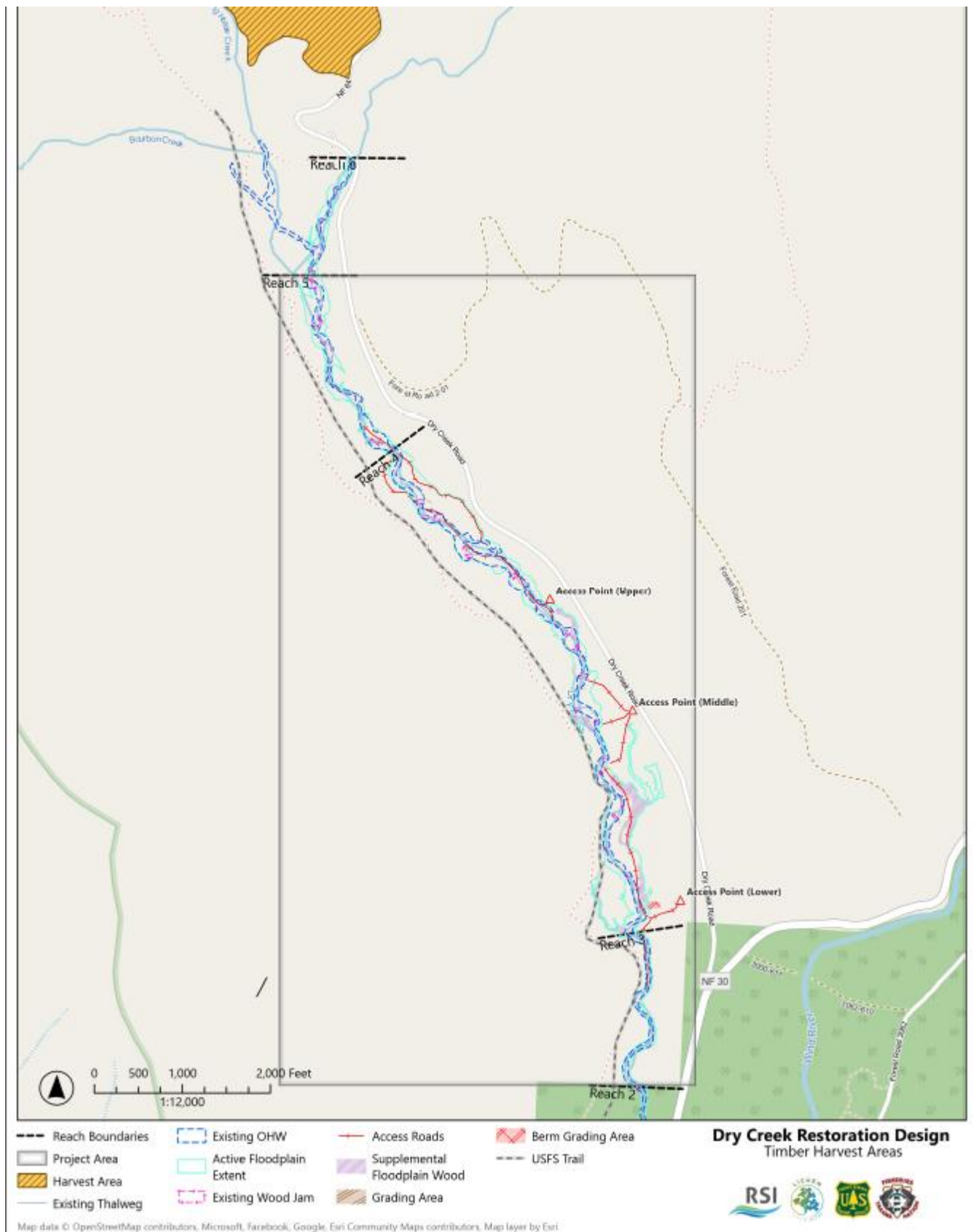
Figure 2: Restoration Area Overview: project area, access points, off-site harvest area, and USFS trail.