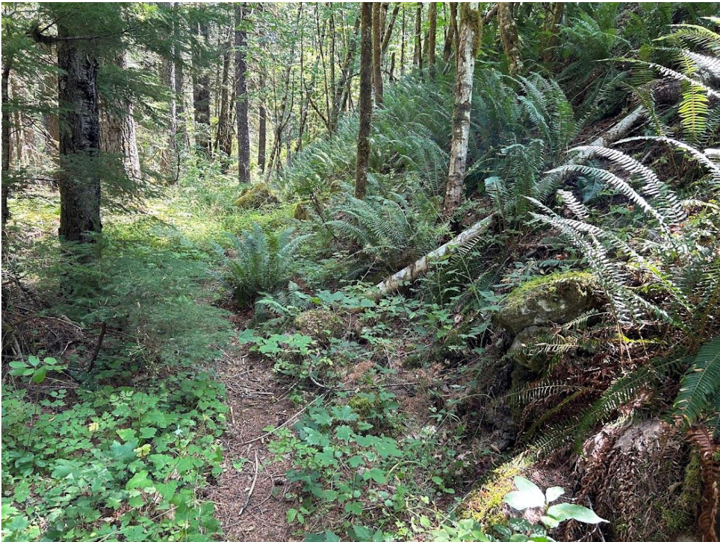
Site Photo 2: Trail next to spoil pile, looking toward Dry Creek