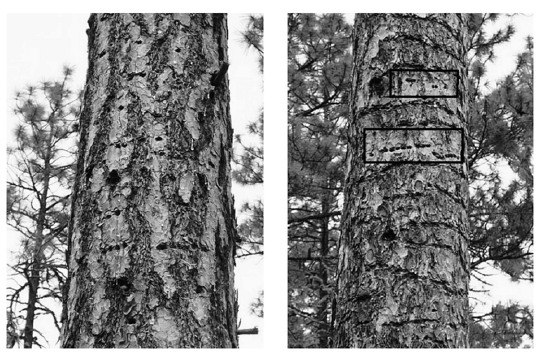
FIGURE 1. White-headed Woodpecker sap wells in Ponderosa Pine trees along the east-slope of the Cascade Range, Yakima County, Washington, 2008: left) recently excavated in rows and single exploratory holes; and right) recently excavated rows (solid boxes) among old sap wells.

detail. In addition, sap feeding by White-headed Woodpeckers has yet to be described in Washington. In this study, I describe the characteristics of trees used by White-headed Woodpeckers for sap feeding and comment on observations of sap feeding behavior along the east-slope of the Cascade Range, Yakima County, Washington. Information on the use of tree sap as a food resource by White-headed Woodpeckers will add to our understanding of the natural history of this species, much of which remains unknown (Garrett and others 1996).